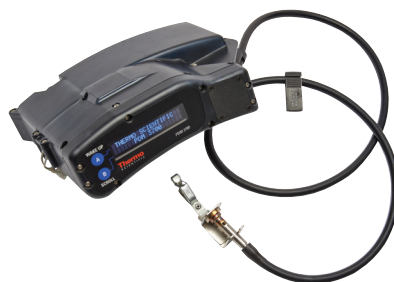
Thermo Scientific™ PDM3700 Personal Dust Monitor

Proven underground capable, through the success of the PDM3600 monitor, the PDM3700 monitor also offers accurate, continuous, personal respirable dust exposure information. Capable of satisfying the typical mine environment, the durable, belt-mounted case is made of staticdissipating housing.