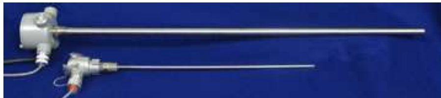
Activator Heater & RTD Temp Probe