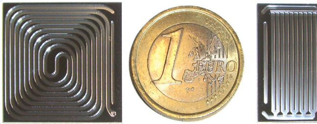
MEMS for pre concentration and gas chromatographic separation

- Micro Electro-Mechanical Systems (MEMS), applied to the selective preconcentrator and to the column of chromatographic separation (proprietary technology)